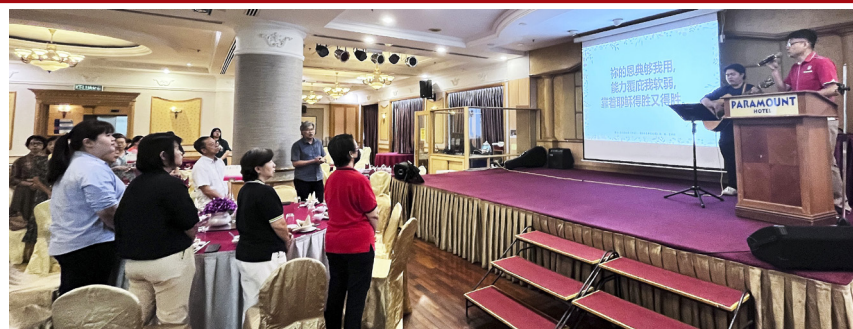
8 November: MTS community was invited to attend the Paramount Hotel's Year-End Thanksgiving Service and luncheon.